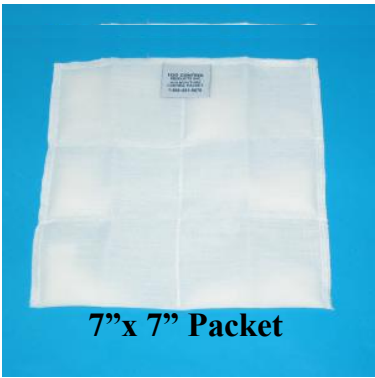
7”x 7” Packet