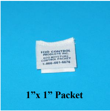
1”x 1” Packet

Our 2”x 2” Packets protect 3 cubic feet enclosures. The part# is H2O221T