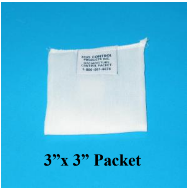
3”x 3” Packet

Our 2”x 5” Packets protect 5 cubic feet enclosures. The part# is H2O252T