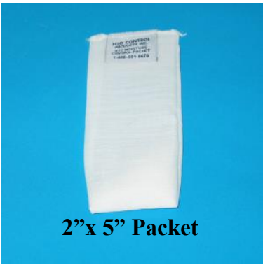
2”x 5” Packet

Our 3”x 7” Packets protect 8 cubic feet enclosures. The part# is H2O373T