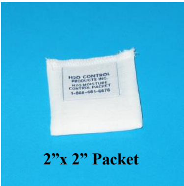
2”x 2” Packet

Our 3”x 3” Packets protect 5 cubic feet enclosures. The part# is H2O331T