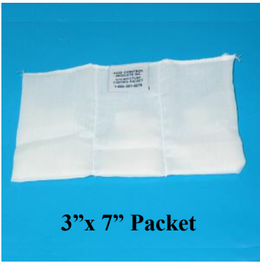
3”x 7” Packet

Our 7”x 7” Packets protect 20 cubic feet en clo su re s. The part# is H2O776T